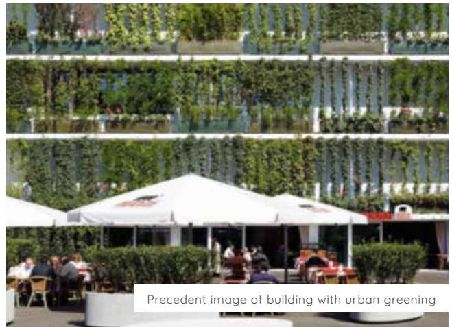
Precedent image of building with urban greening