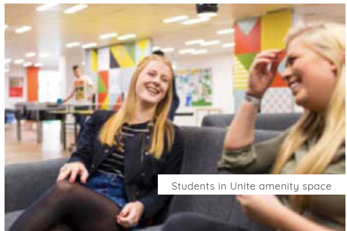
Students in Unite amenity space