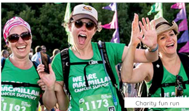
Charity fun run